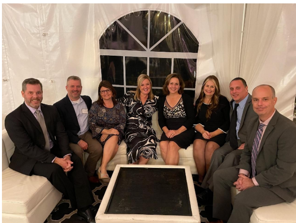
Jill & Co. Realty