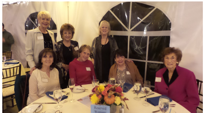
Salem Women's Club