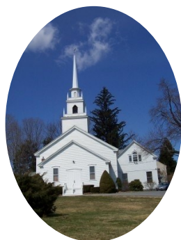
Atkinson Congregational Church