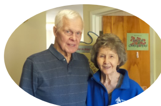
Pelham Good Neighbors