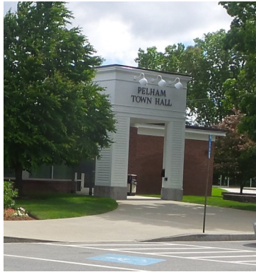
Town of Pelham