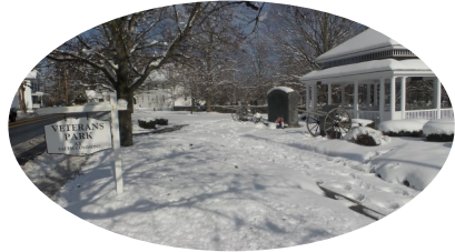
Town of Salem