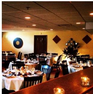
Black Water Grill