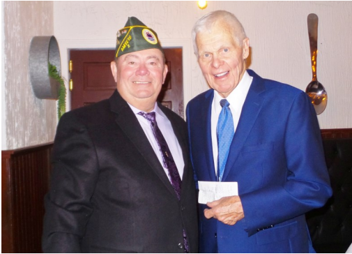
Amvets NH Post 2– Salem