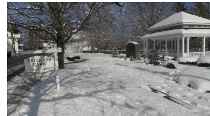
Town of Salem