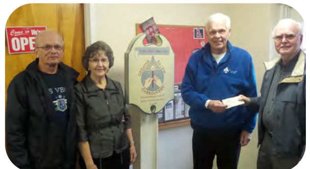
Pelham Good Neighbors