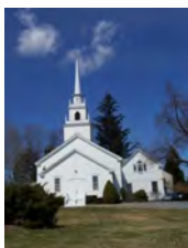
Atkinson Community Church